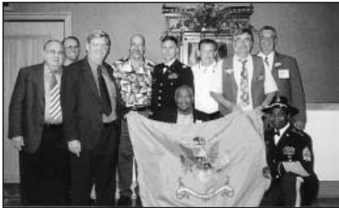
1/10 Cav. with Regimental flag at Officer's Club, Ft. Hood. Saturday, Sept. 13, 2003.