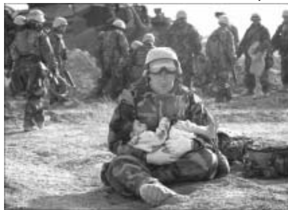
Recent photos from Iraq