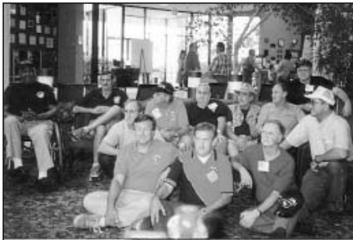
1/10 Cav. Nam Vets sending video to 1/10 Cav. in Iraq. Photos by Charlene Weibel, proud wife of Terry Weibel, 1/10 Cav. Wisconsin Chapter.