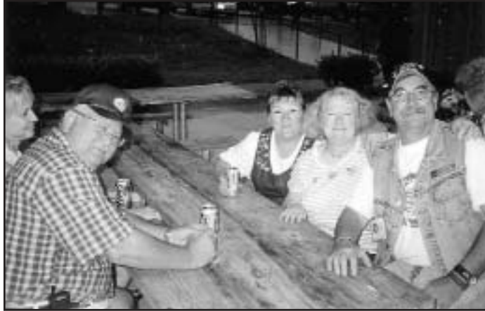
1/10 Cav. Picnic.